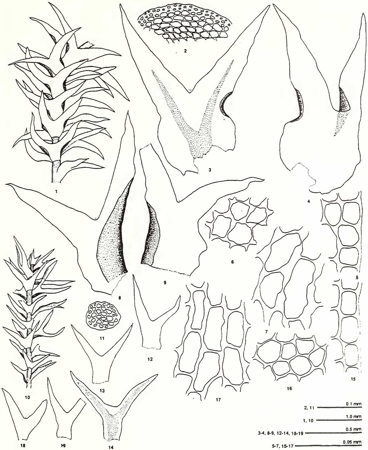
Fig. 2: Herbertus sikkimensis (Steph.) Miller. 1-9. (LWG 208735-A): 1. Plant ventral view; 2. Cross-section of stem; 3-4. Leaves; 5. Leaf marginal cells; 6. Leaf median cells; 7. Leaf basal cells; 8-9. Underleaves. Herbertus fragilis (Steph.) Miller. 10-19. (LWG 208733-B): 10. Plant ventral view; 11. Cross-section of stem; 12-14. Leaves; 15. Leaf marginal cells; 16. Leaf median cells; 17. Leaf basal cells; 18-19. Underleaves